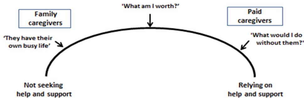
Figure 1. Pictorial presentations of the findings.

focused on the participants' perceptions about themselves as helpless and dependent on others in performing everyday task in general, and during the hospital setting, in particular. The second theme was identified as 'What would I do without them?' This theme referred mainly to the migrant home care workers but also to the nursing staff. It meant immense gratitude, but also a sense of powerlessness and dependence on paid caregivers for support. The final theme concerned participants' low treatment expectations from their family members in the hospital setting due to their perception of their family members as having multiple obligations and duties in addition to their caregiving role. This theme was identified as 'They have their own busy life'. Figure 1 provides a pictorial illustration of the thematic findings that emerged in this study.